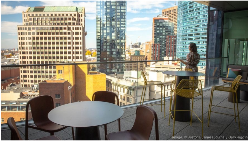
Each floor of Deloitte's new offices at Winthrop Center has an outdoor terrace overlooking the city. Expand to read more

To draw in employees, the new space has everything from “retreat suites,” to grab a quiet moment, to a virtual health room, where employees can have a private tele-meeting with their health care professionals. They also have access to Millennium’s common amenities for tenants, including a gym, cafe, game room and the building’s “Club VIP” pet spa.