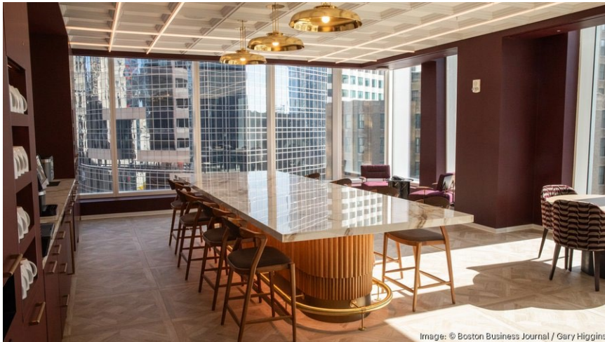
The client lounge, where Deloitte employees and clients can take breaks or gather for a team dinner. Expand to read more