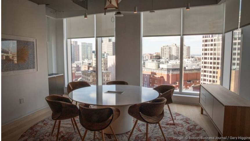
Deloitte has part of the 12th floor and all of the 13th, 14th and 15th floors. Expand to read more