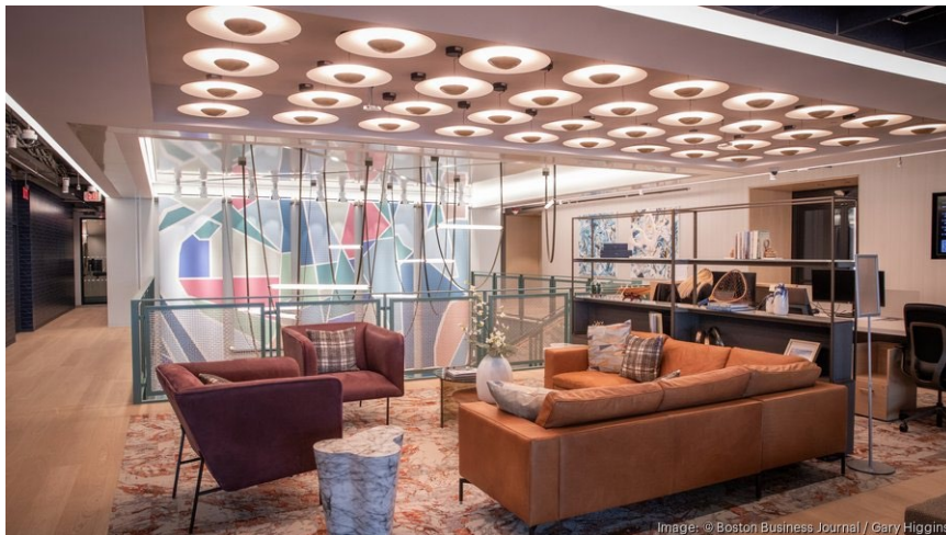
A common area by the entrance to the 15th floor, Deloitte's top floor in the building. Expand to read more