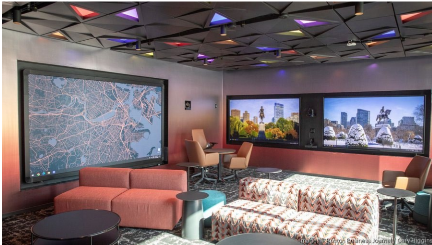
Another collaborative space. Expand to read more