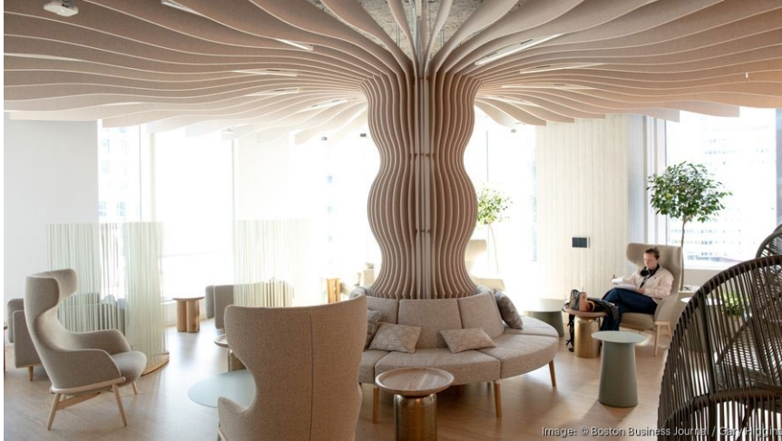
A "retreat suite" where employees can come to decompress and relax. Gensler designed the office interior. Expand to read more