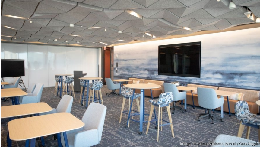
A client immersion studio can be subdivided into smaller rooms and is meant to facilitate meetings and receptions with the firm's clients. Expand to read more