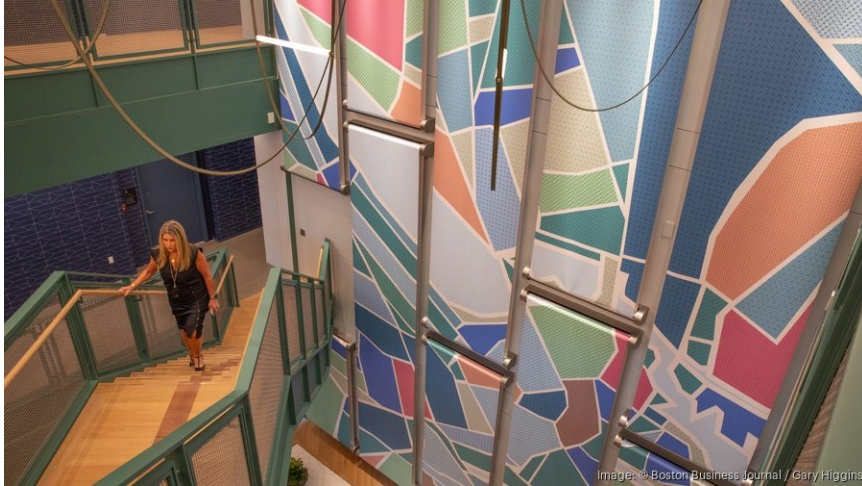
An ever-moving map of Boston takes up multiple floors of the office's internal staircase. The artwork is an homage to the printing press, a nod to Boston's status as the first-ever home to a printing press in the U.S. Expand to read more