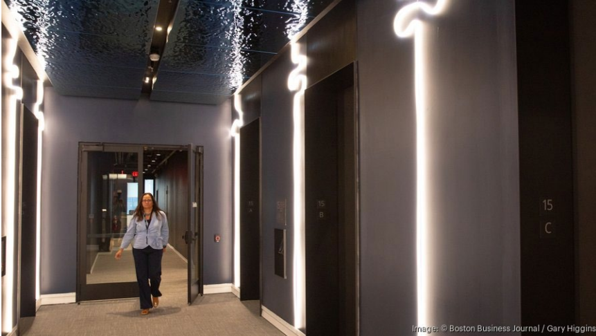
Elevators leading into the office. Expand to read more