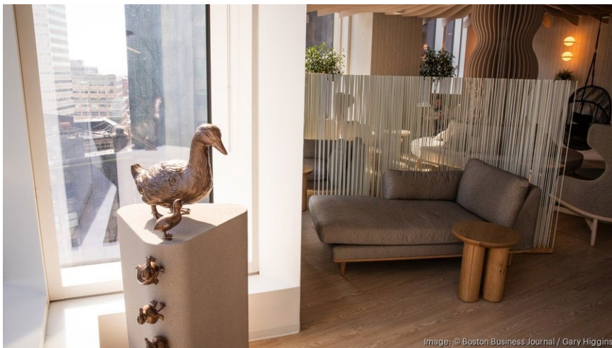
The office is full of references to the city, such as this homage to the "Make Way for Ducklings" statues. Expand to read more